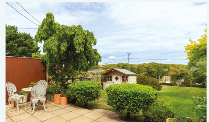
Jasmine Cottage, Atherfield Road, Atherfield, Nr Shorwell, Isle of Wight